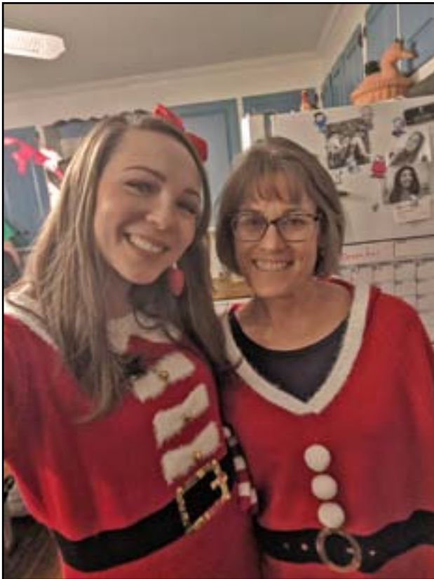
Two of Santa's best elves!

Thank you to all the trunks that were festively decorated for the 2019 Trunk or Treat. Congrats to third time winner