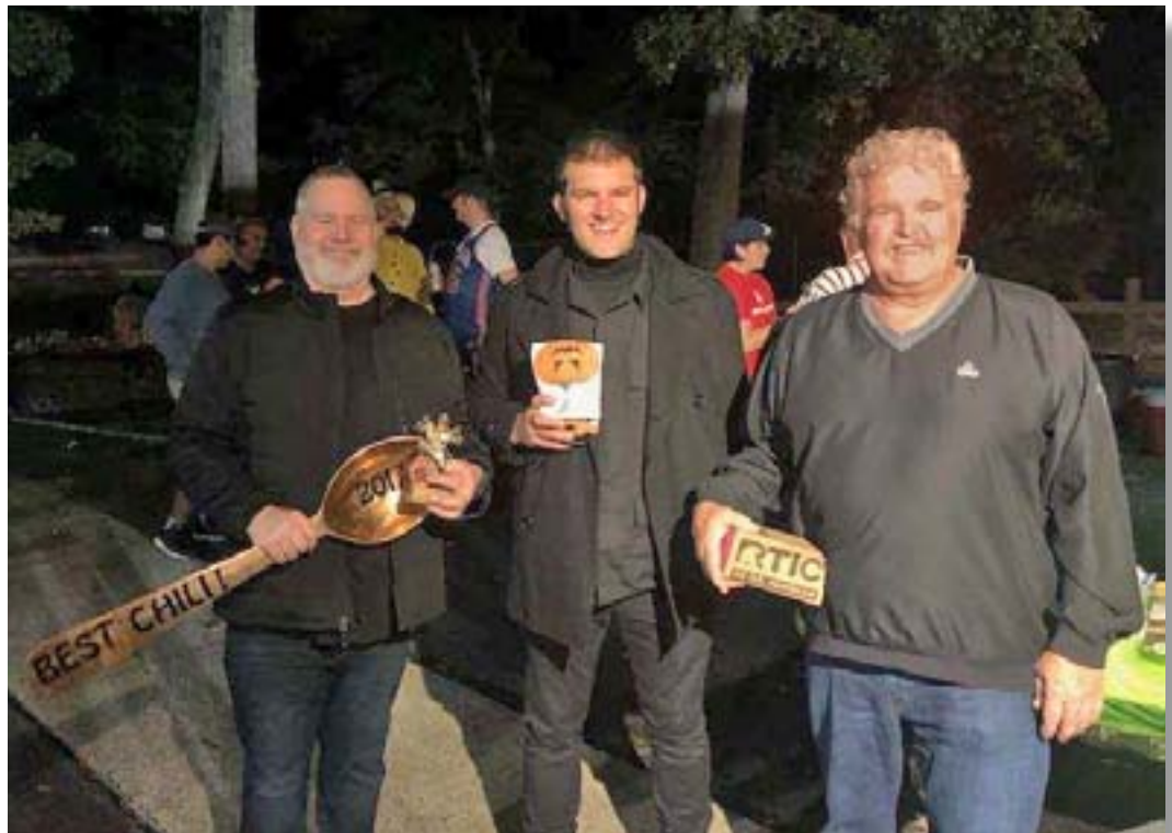
Congratulations to Derek's Chili for taking back the Surreywood Cup in our Chili Cookoff!

We hope to have the work completed in the January/February timeframe so we can have the lake up and ready to go once the weather turns nice in the springtime.