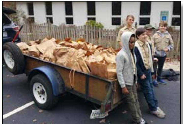
Thanks, Surreywood for your support for our Food Drive!!

Next event- Mark your calendars for the 2020 Eggstravaganza Egg Hunt- Saturday, April 11.